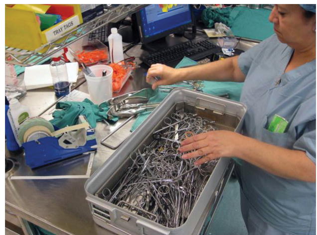
Illegible labels on medical devices can lead to inefficiencies and safety hazards.