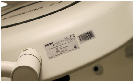
Asset Identification Labels

frustrations and health risks. Metalphoto is used for permanent medical/surgical device and procedure identification applications such as asset identification/UDI barcode labels, procedure identification/communication signs, sterilization container labels & systems, surgical device control panels and several others.