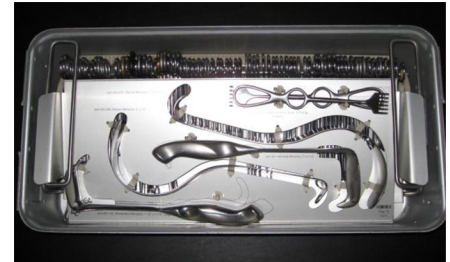
Sterilization Container Systems

Metalphoto® signage memorializes procedures and stays readable after cleaning, sterilization and other abuse.